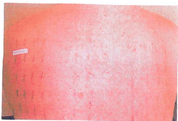
Fig. 2. Patch testing on fragile skin using Reskin® silicone dressing: no irritation, erythema or skin loosening were observed; there was a clear positive reaction to amcinonide (++ day 7).

to budesonide (0.01% pet.), a marker for corticosteroid allergy (Fig. 2). Six weeks later, the patient was additionally tested with a corticosteroid series (4), in order to investigate possible cross-reactions, again using Reskin to fix the chambers and with the patient wearing a tightly-fitting T-shirt. No technical problems were encountered, and the patient showed a (late) positive reaction to amcinonide only (++ at day 7) (Fig. 2). This is another acetonide that cross-reacts with budesonide. The relevance to the patient's dermatitis could not be established.